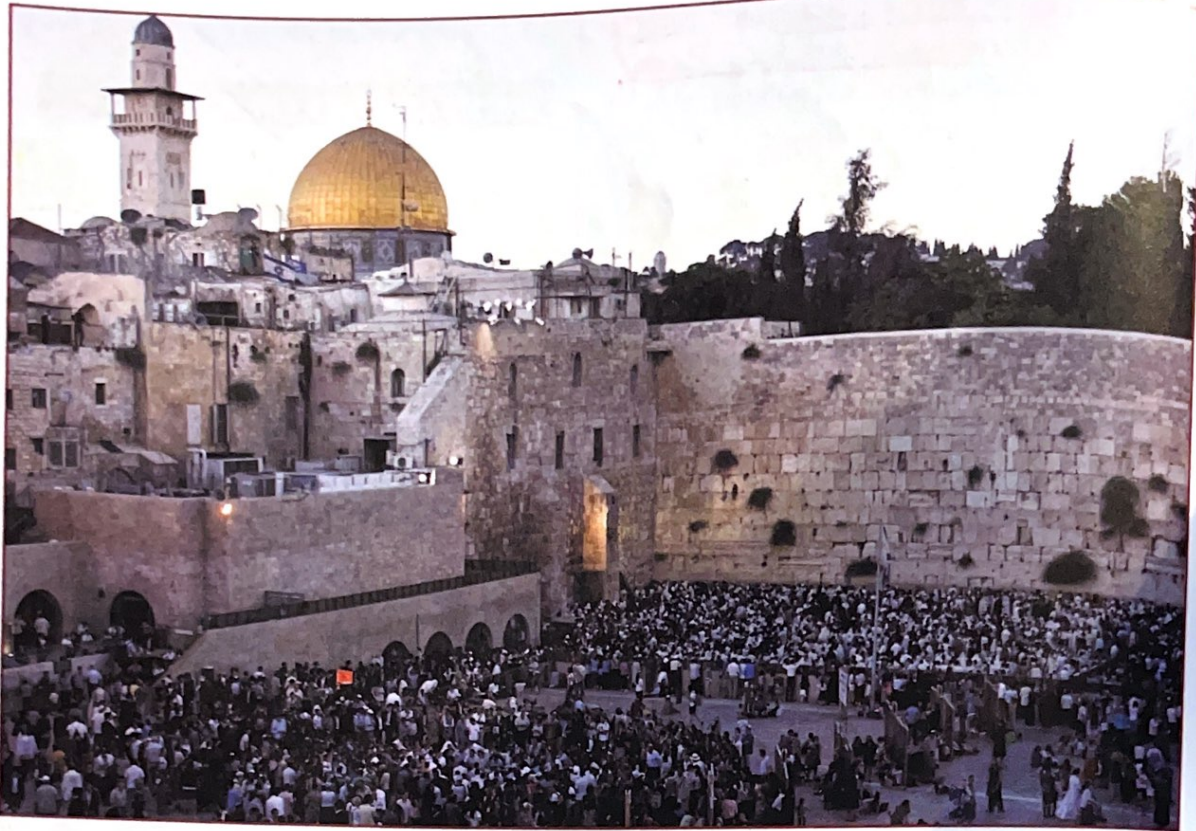
FIGURE 1.1 THE WESTERN WALL OF THE TEMPLE

This wall is the most intact part of Herod's Temple that remains. The sanctuary of the temple and the area for sacrifices stood above this wall. The Romans destroyed the other parts of the temple complex in 70 C.E. when they sacked Jerusalem to end a revolt.