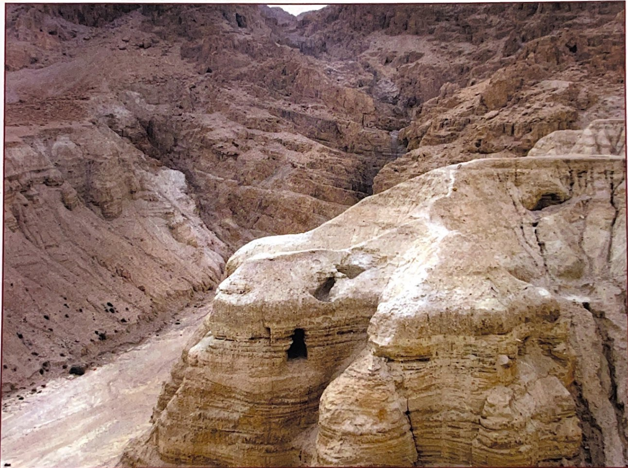
FIGURE 1.3 QUMRAN

text of every book in the Hebrew Bible except Esther . These copies were made just before and during the time of Jesus. For the most part, the scrolls demonstrate the care with which the copyists preserved the ancient text. But in some cases, we can see the ways that some books of the Hebrew Bible were still under construction. For example, some of copies of Jeremiah found among the scrolls are like the longer text in the Greek translation, others like the later accepted